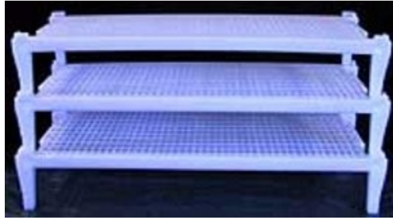
Plastic stackable shelving.

Other types of shelving that are available include stackable plastic shelves (see photo below from Dairy Connection). Available at Glengarry Cheesemaking and Supply, Dairy Connection and Fromagex.