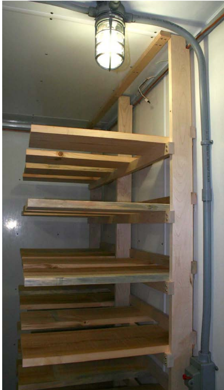
Photo 3. The second rack built at Little Falls Farm.

The third photo of the second rack we built, is a better design than the first rack. The horizontal pieces are recessed in to the upright brace, making it stronger, but might not be necessary.”