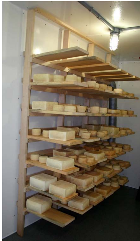
Photo 1. and 2. This is the first rack we built.